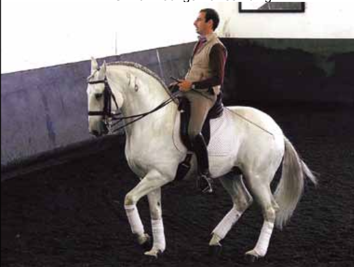
RAJA , sire of Zimbrow.