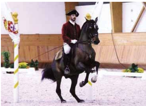
Portuguese School of Equestrian Art.