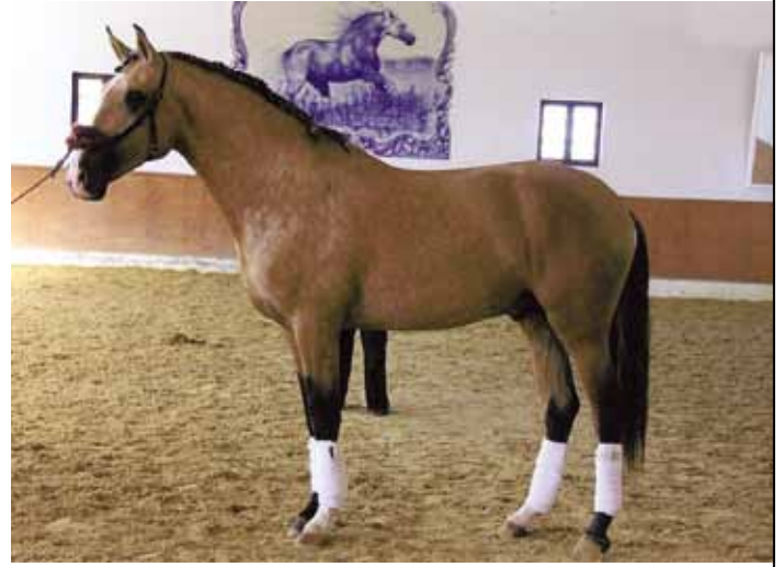
Golden buckskin is CAMPEADOR